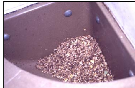
Soaked feed in manger