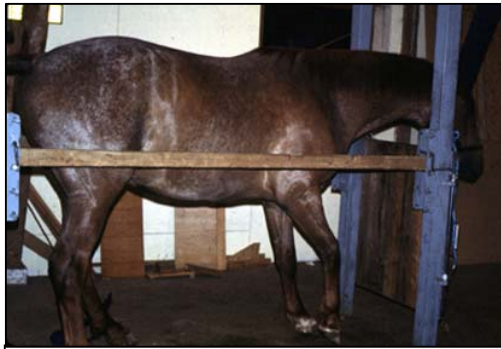
Horse with laminitis shifting its weight off its front feet

heels landing first to try to avoid concussion to the painful toe region. If all four feet are affected, they may lie down for long periods or may constantly lift their feet alternately from